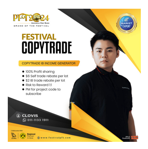
COPYTRADE IB INCOME GENERATOR