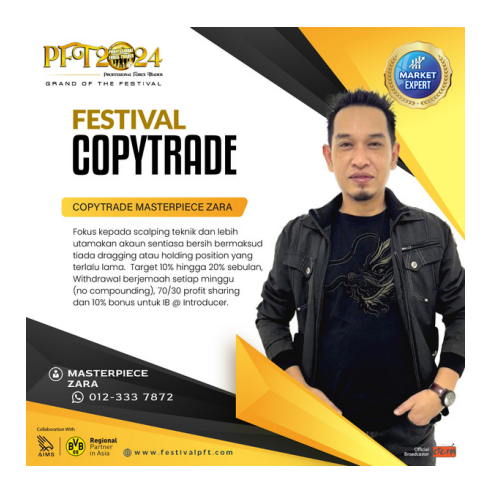
COPYTRADE MASTERPIECE ZARA