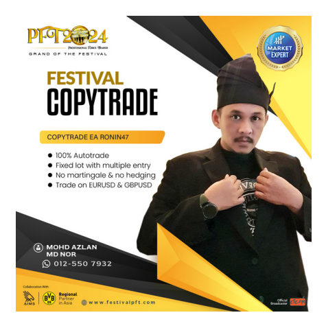
COPYTRADE EA RONIN47