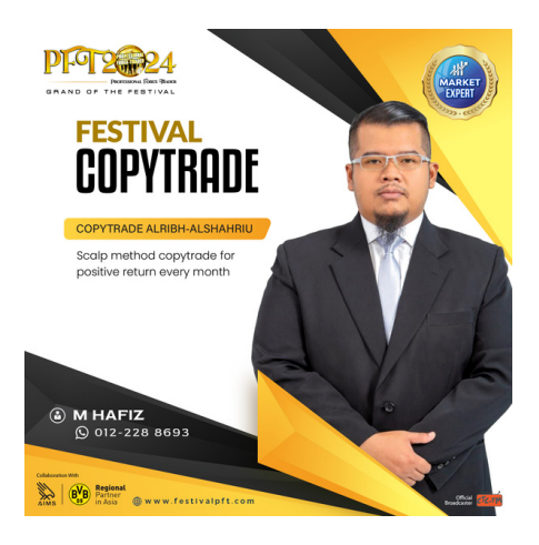
COPYTRADE ALRIBH - ALSAHRIU

Risk Management is a priority in trading.