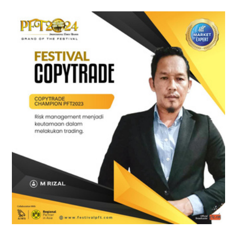
COPYTRADE CHAMPION PFT2023

Risk Management is a priority in trading.