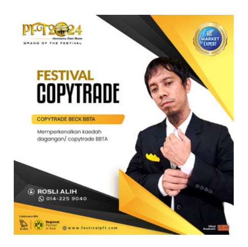
COPYTRADE BECK BBTA

Risk Management is more important than ever.