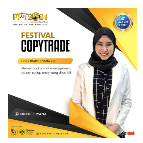
COPYTRADE LIYANA YN

Risk Management is more important than ever.