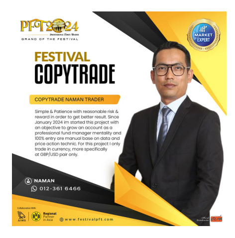
COPYTRADE NAMAN TRADER